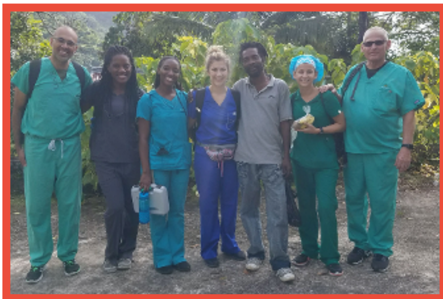
Doctors and students with the Jamaican national who returned after treatment with gifts for everyone